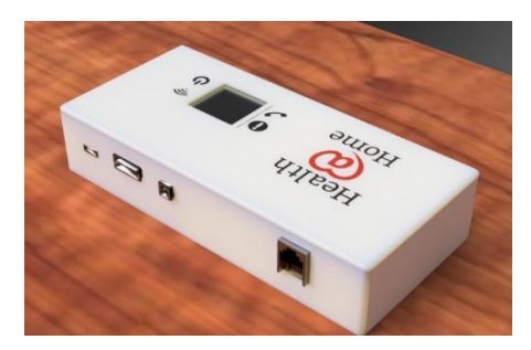
The PHG750 is powered using the micro USB connector (left). The PHG750 also provides an audio port for headphones and a mini-HDMI port

When being used with a USB battery source, LNI recommends using a power supply that can provide 2.5 Amps of USB power.